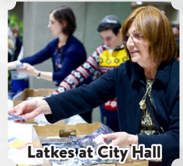
Original Menorah Team