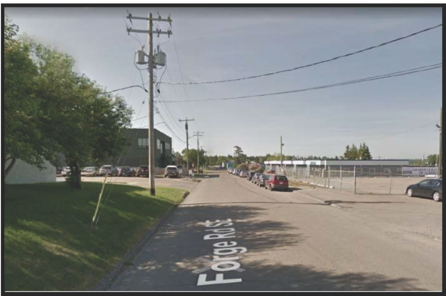
VIEW SOUTH ON FORGE ROAD SE