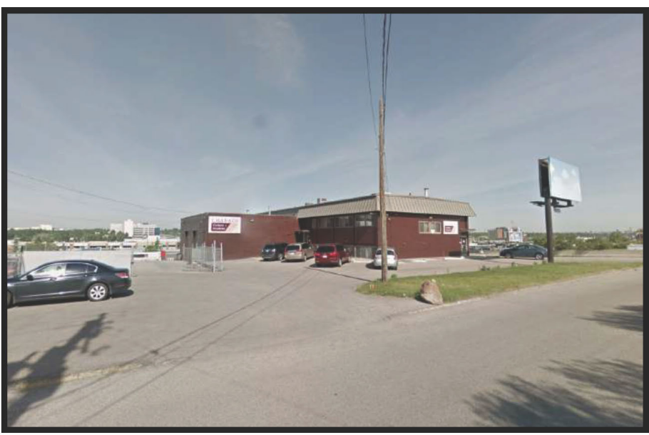
VIEW FROM FORGE ROAD SE

NEW DEVELOPMENT ADDS VIBRANCY ○ AND PROMOTES LONG TERM VIABILITY FOR COMMUNITIES