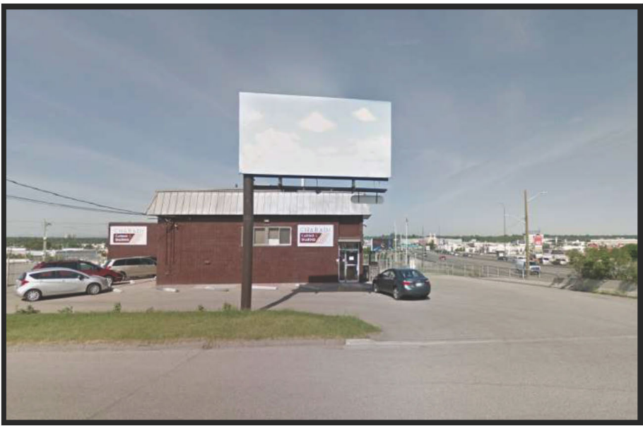
VIEW EAST FROM FORGE ROAD SE