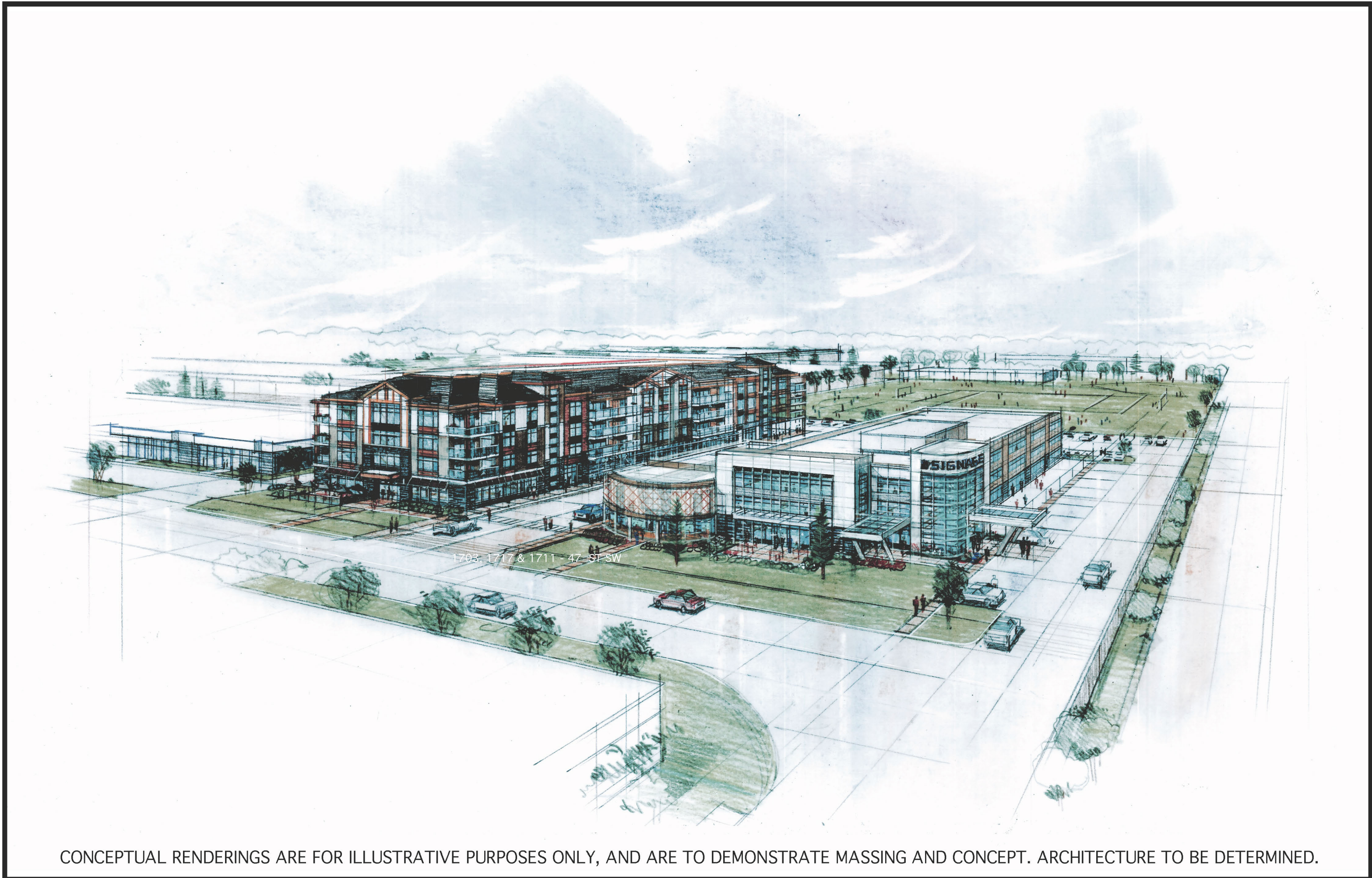
CONCEPTUAL RENDERINGS ARE FOR ILLUSTRATIVE PURPOSES ONLY, AND ARE TO DEMONSTRATE MASSING AND CONCEPT. ARCHITECTURE TO BE DETERMINED.